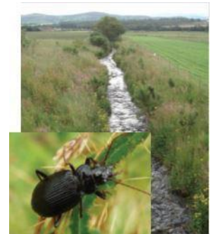
Riparian buffer strip, Tarland and the ground beetle Nebria brevicollis